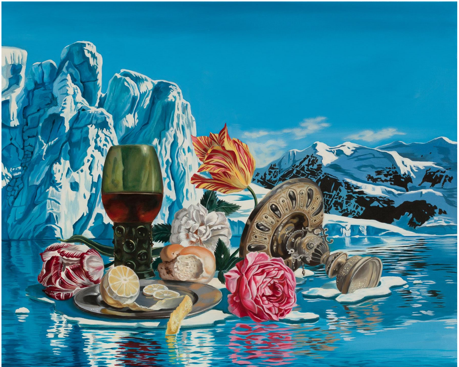
Still Life with Wine and Glaciers 16x20 in. Oil on Panel, 2022