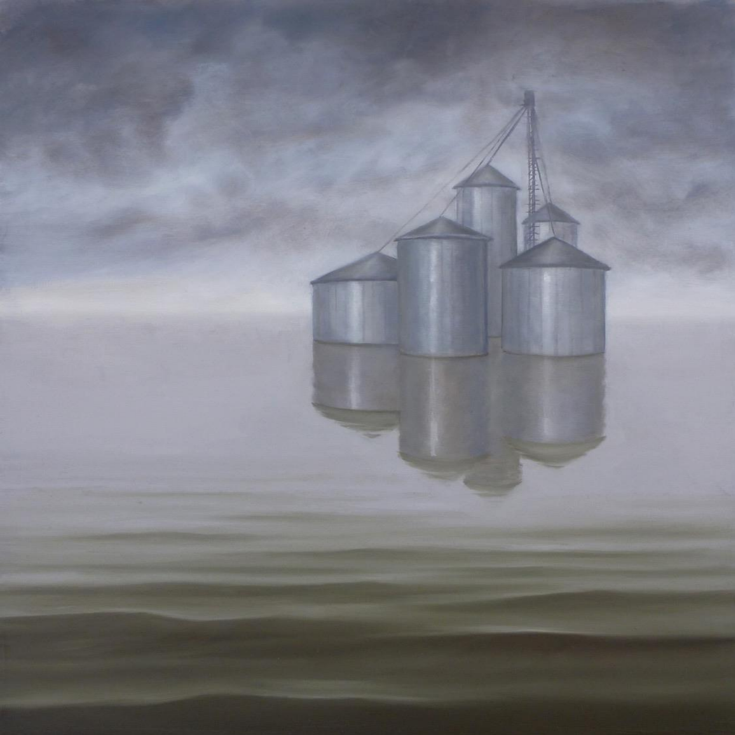
Silos 12 x 12 inches Oil on Panel 2014