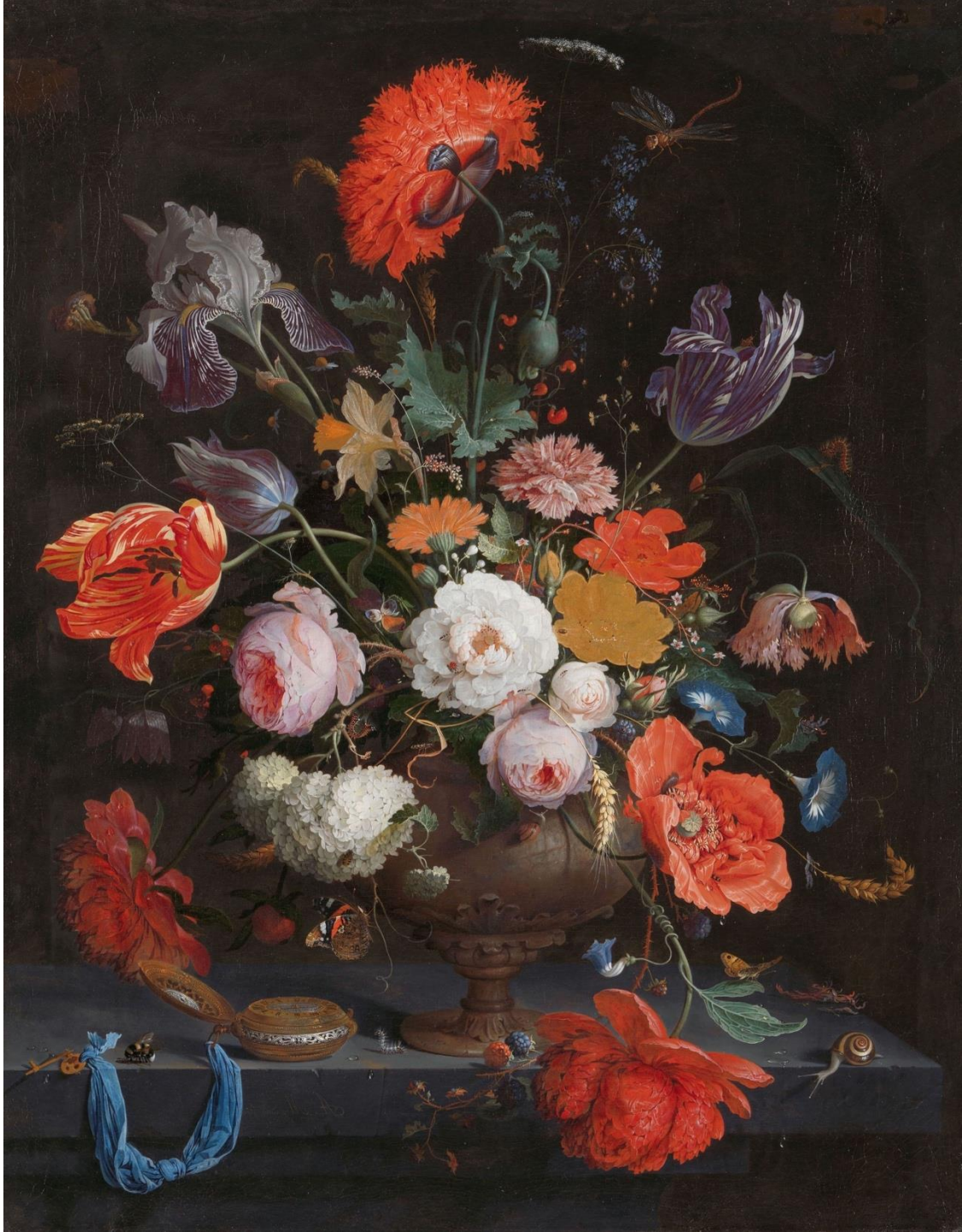
Still Life with Flowers and a Watch