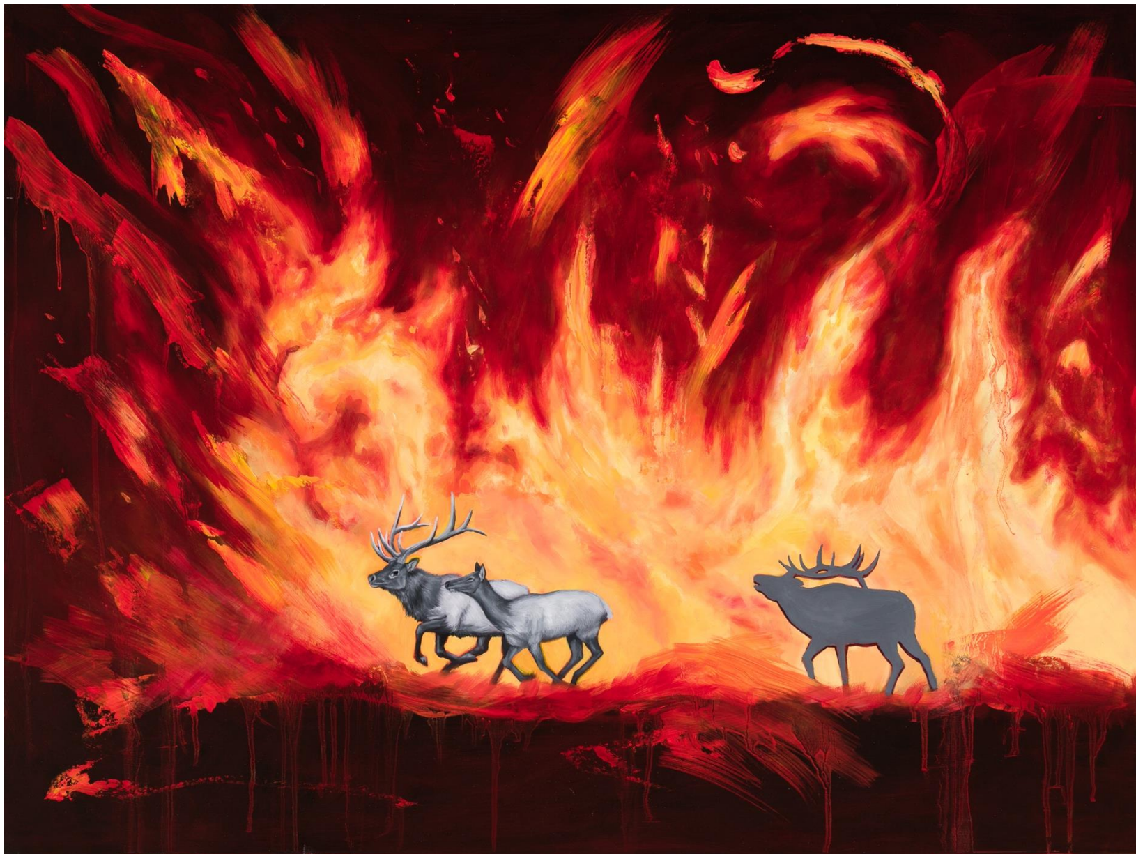
Out of the Flames 18 x 24 in. Oil on Panel 2019