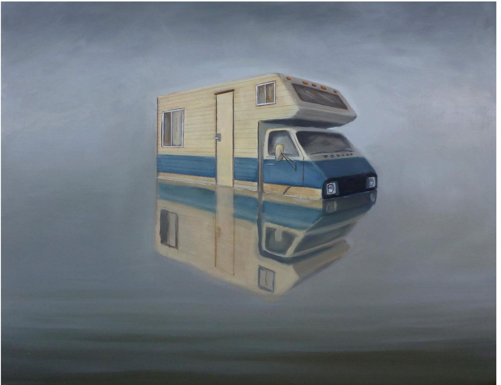
RV , 11 x 14 inches, Oil on Panel, 2014