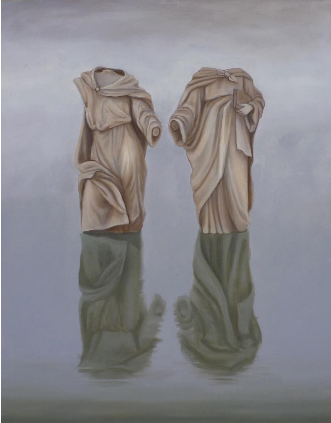
Statues 9 x 12 inches Oil on Panel 2015