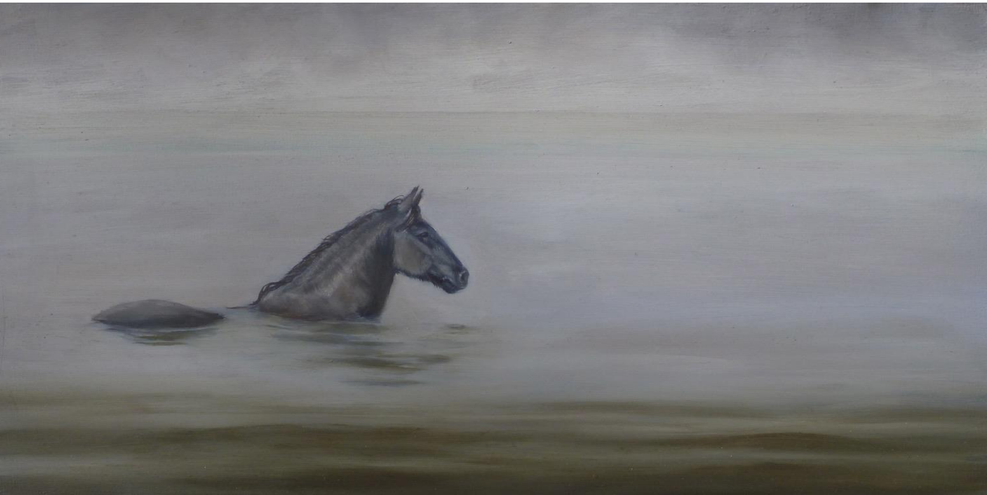
Black Horse , 6 x 12 inches, Oil on Panel, 2014