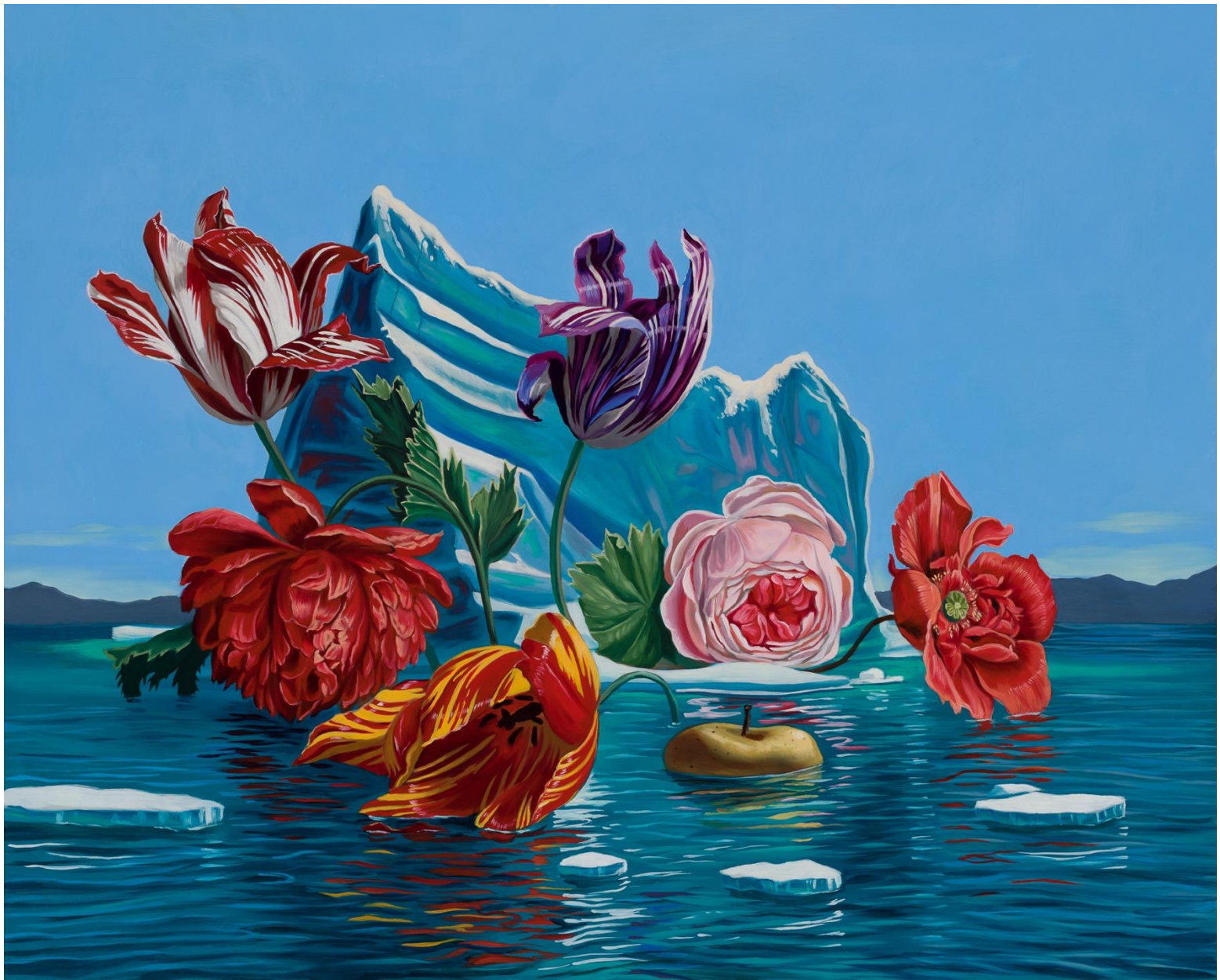
Tulips with Glacier 16 x 20 in. Oil on Panel, 2021