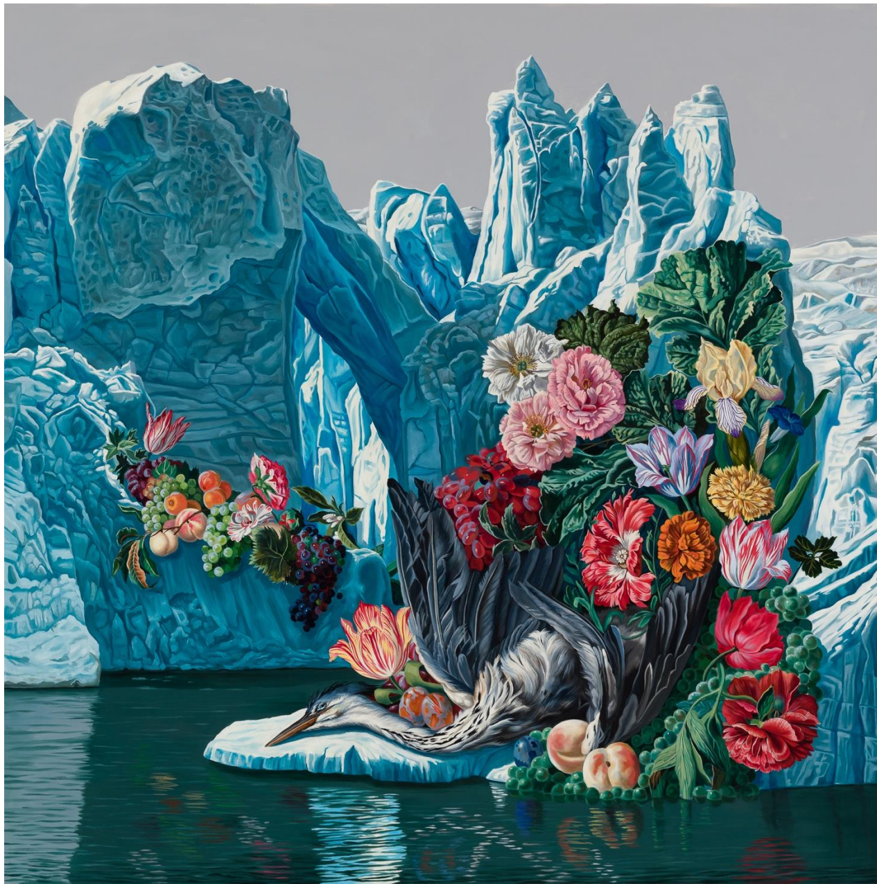
Resting Place 48x48 in. Oil on Linen 2022