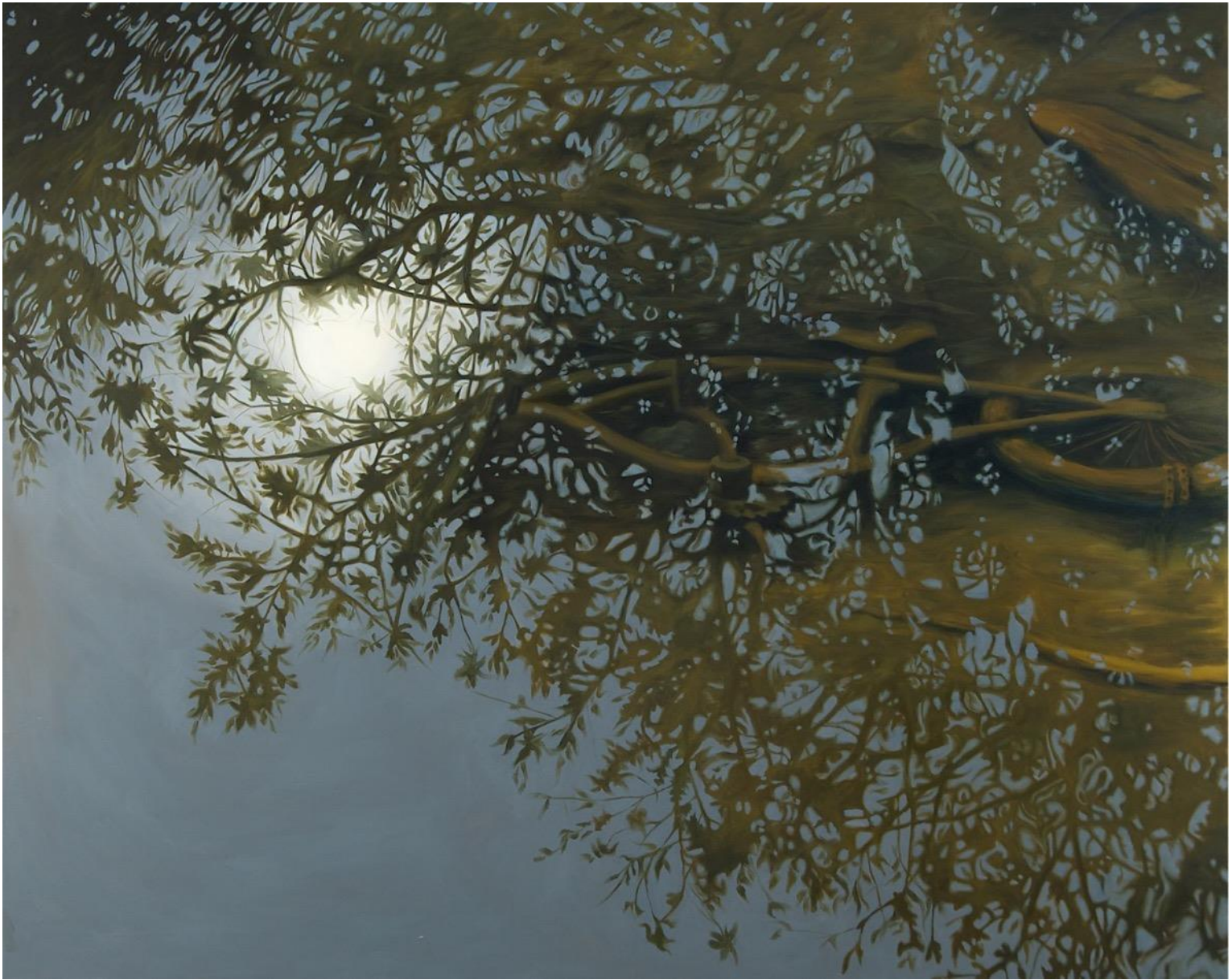
Left Behind , 4 x 5 feet, Oil on Canvas, 2012