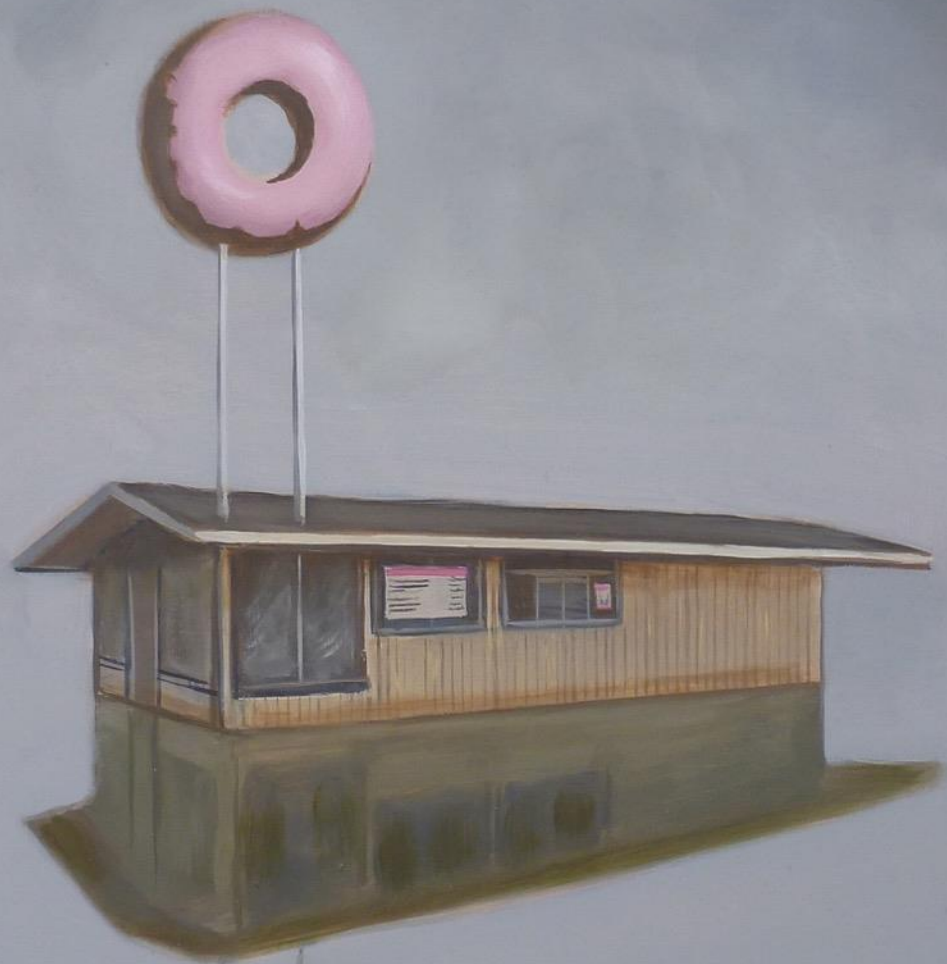
Donut Shop 8 x 8 inches Oil on Panel 2015