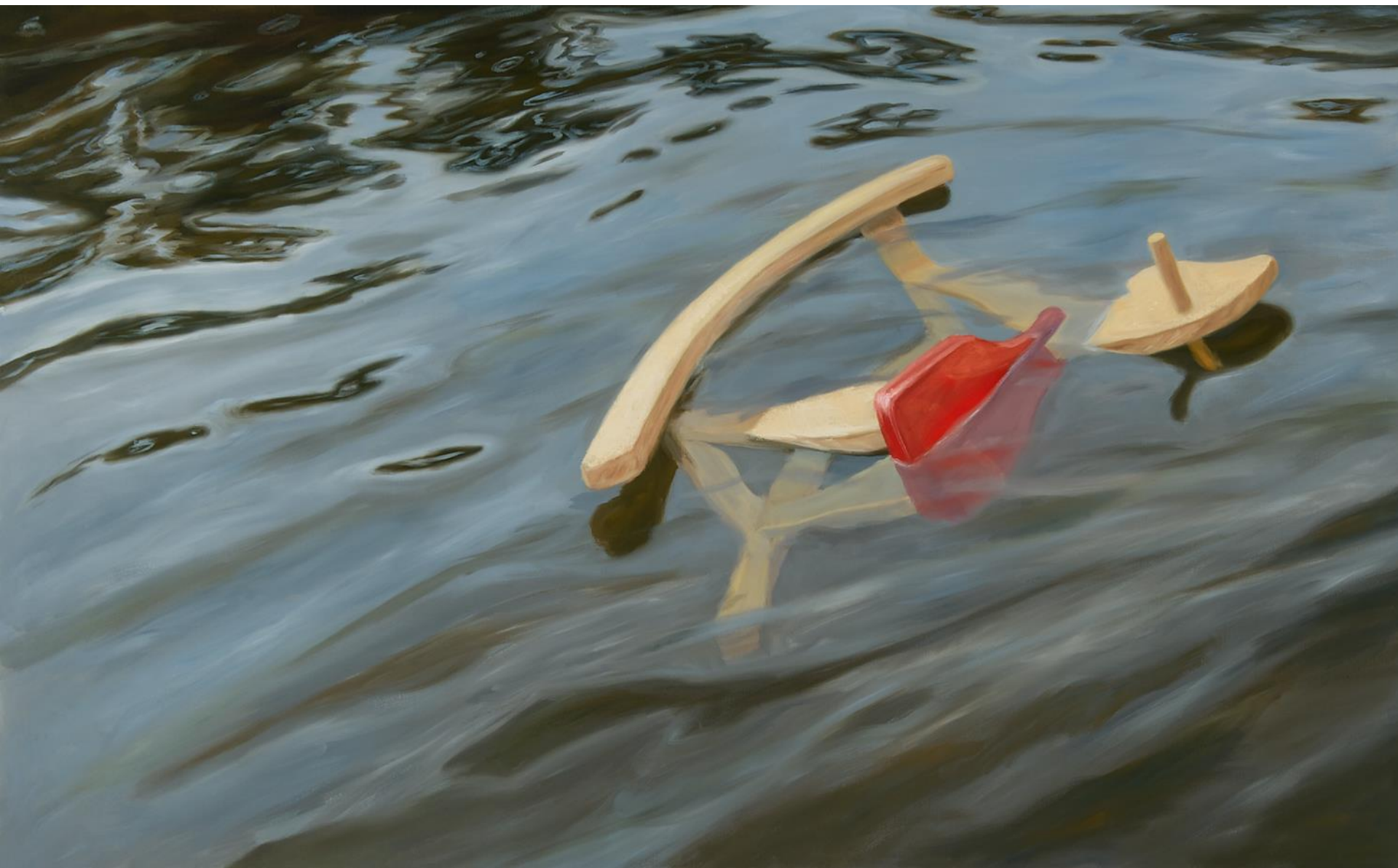
Swept Away 34 x 56 in, Oil on Canvas, 2011