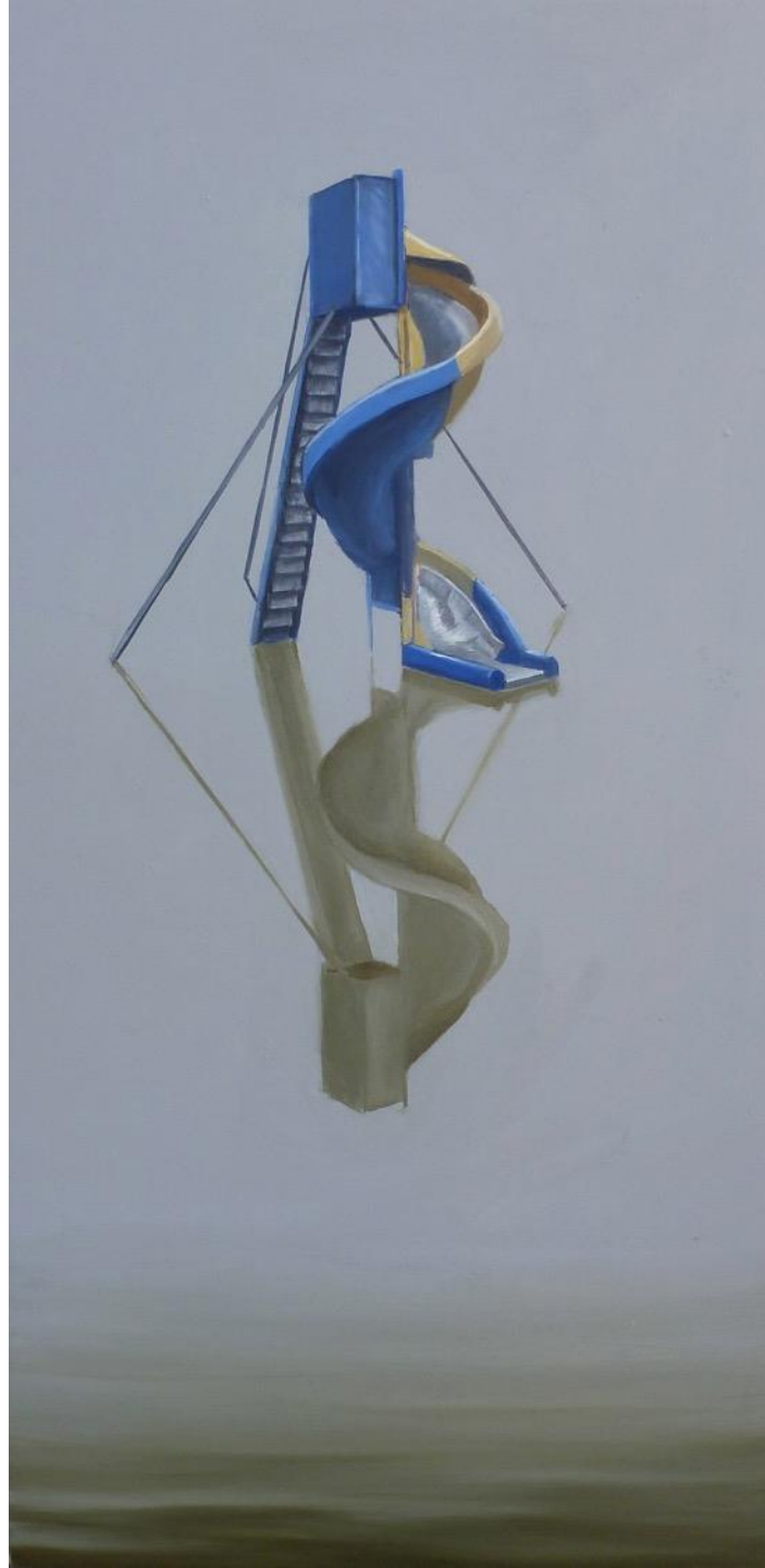
Slide 6 x 12 inches Oil on Panel, 2015