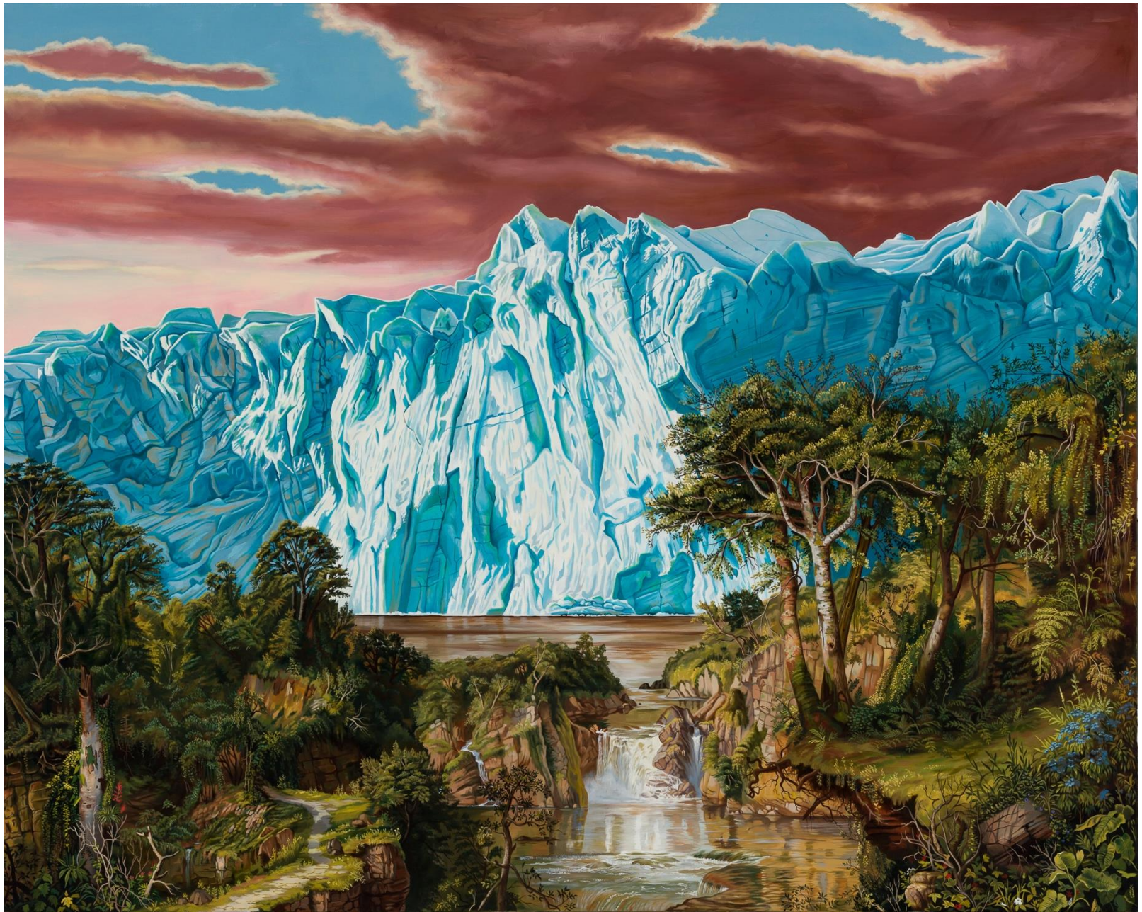
Glaciers Melting into the Andes 48x60 in. Oil on Linen, 2022