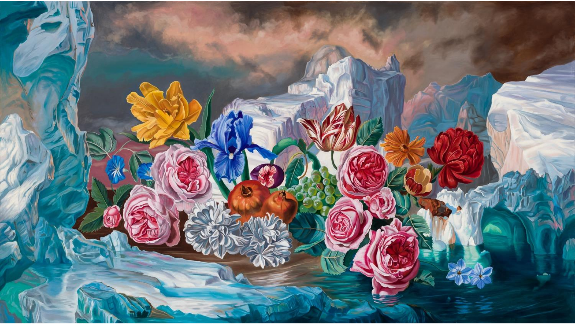
Flowers Growing in a New Climate 38 x 68 in. Oil on Linen, 2021