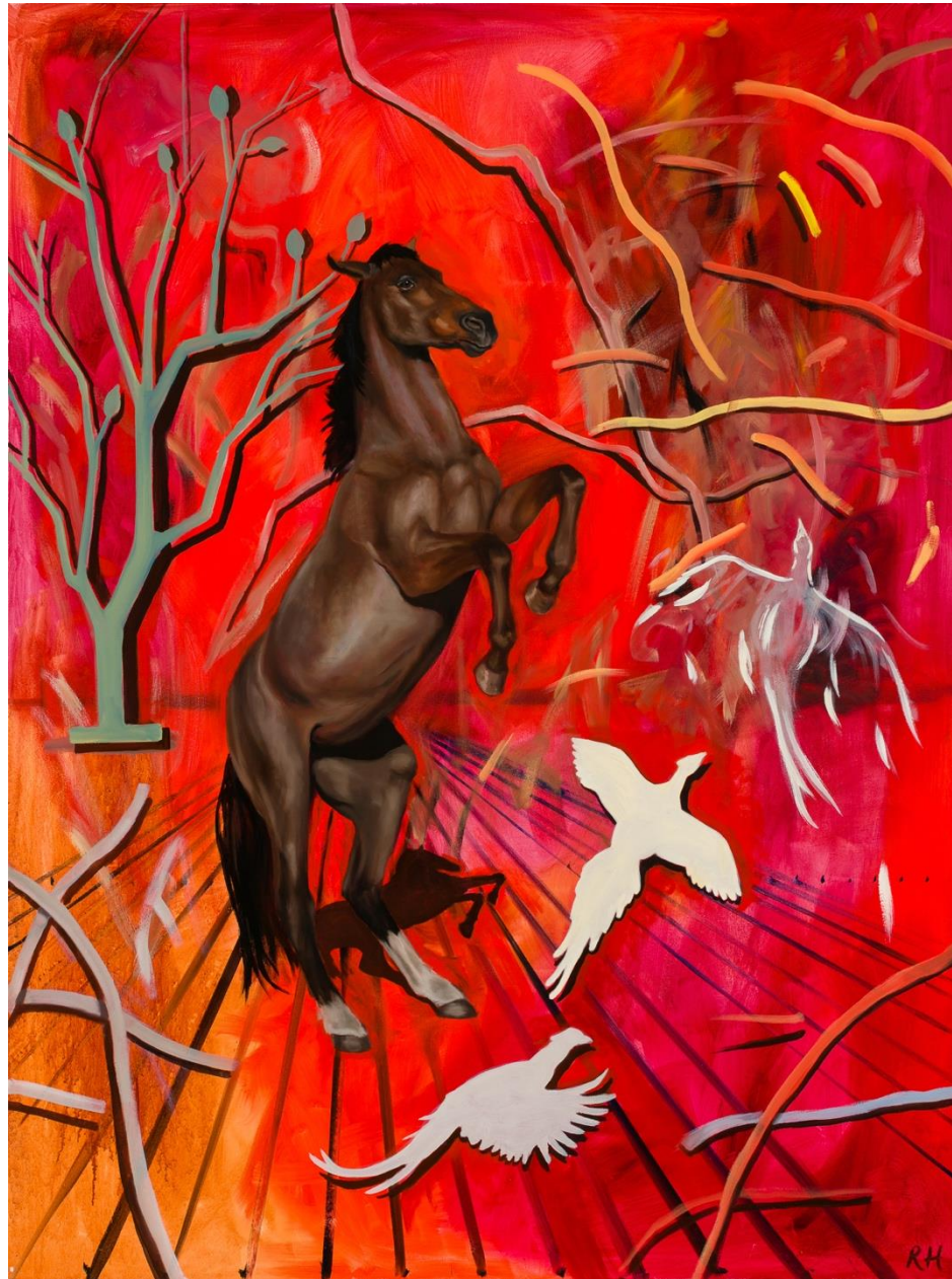
Red Storm , 36 x 48 inches, Oil on Canvas 2016