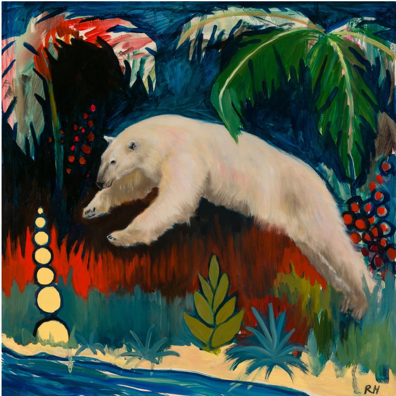
Lost and Found in Paradise , 12 x 12 inches, Oil on Panel, 2017