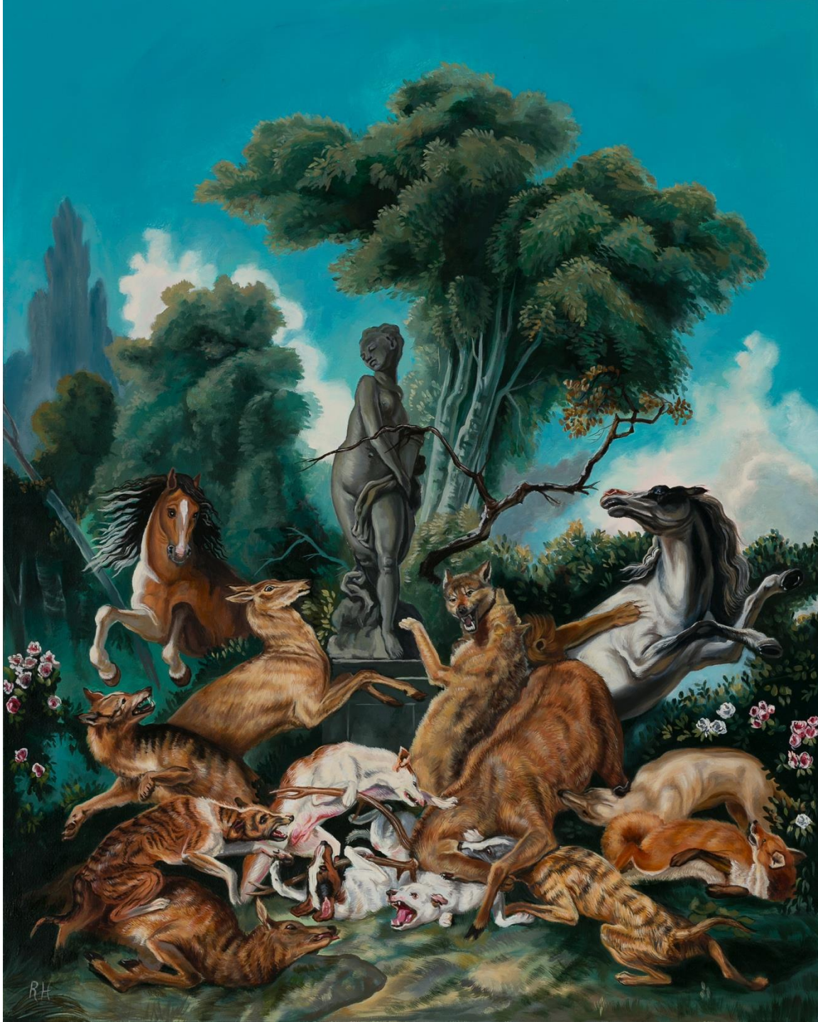
Closing Our Eyes to the Chaos Around Us 16x20 in. 2023