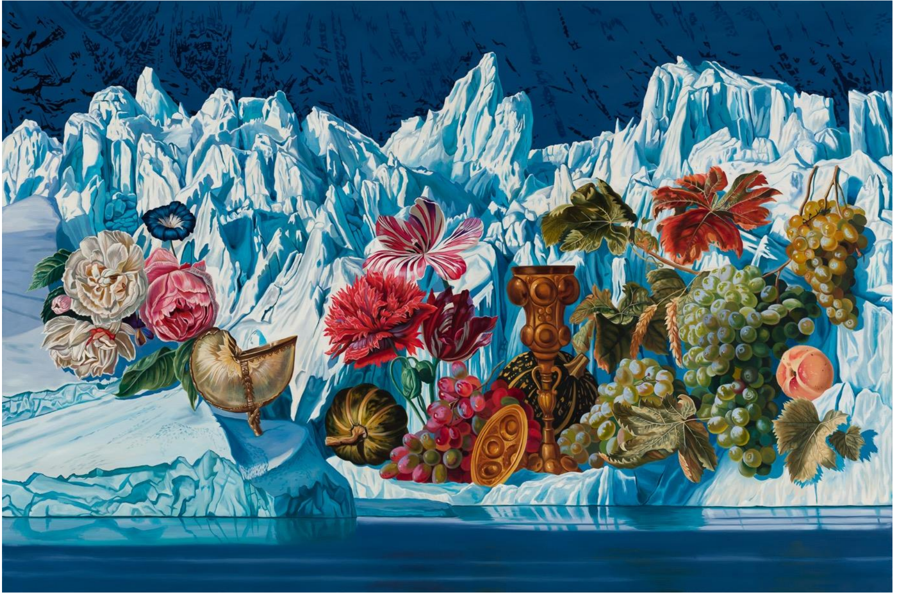
Still Life for a Human Epoch 40 x 60 in. Oil on Canvas, 2022