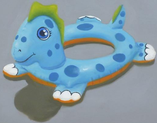
Blue Dragon 12 x 12 inches Oil on Panel 2014