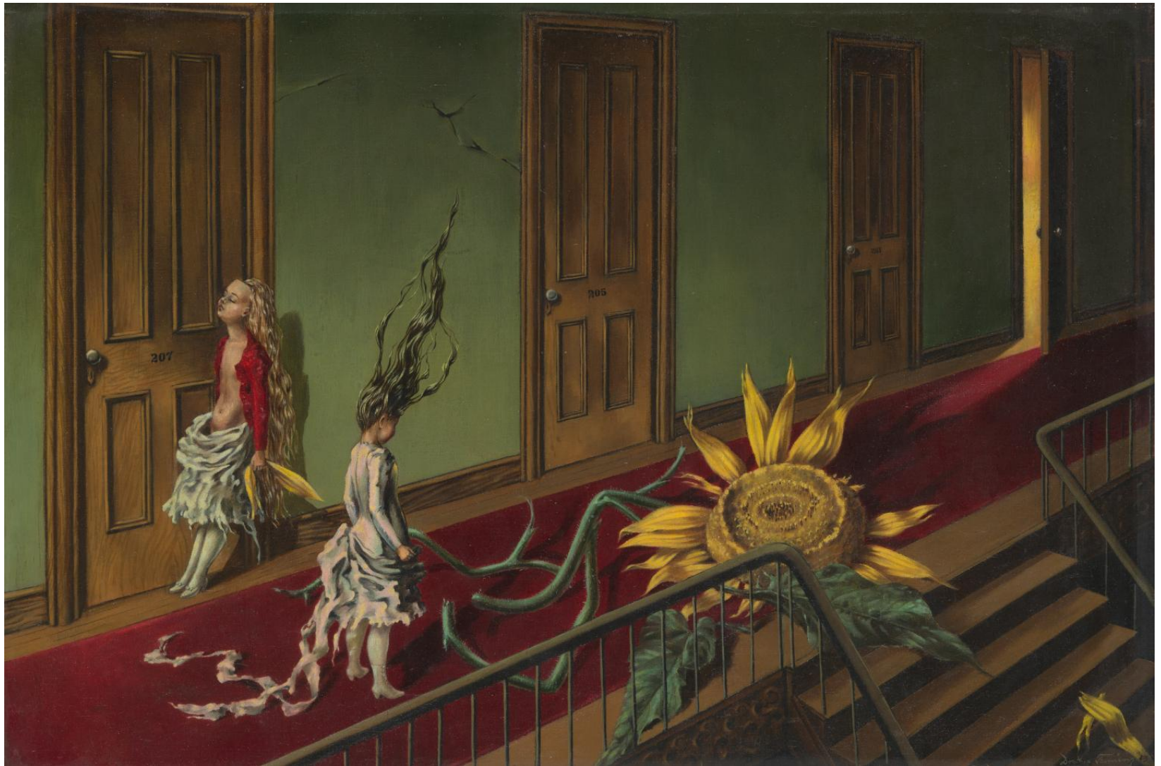
Eine Kleine Nachtmusik (A Little Night Music) by Dorothea Tanning 1943