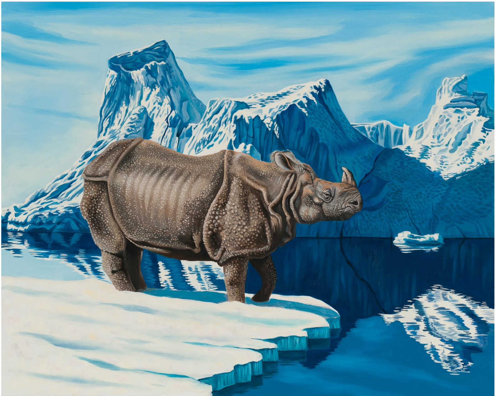
Indian Rhino on Ice 16x20 in. Oil on Aluminum Panel, 2022