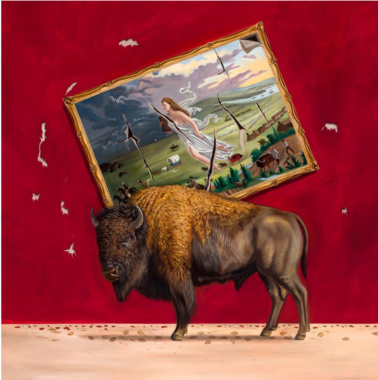
A Buffalo's Perspective on American Progress 24x24 in. Oil on Panel 2023